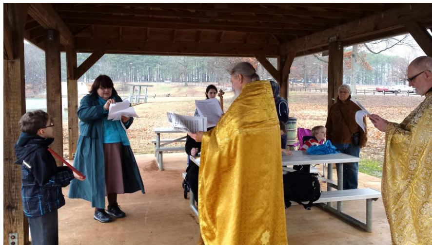
Theophany at Brahan Park (Above) Children's Program reading "Timmy Tiptoes" (Below)