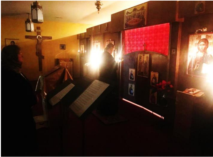
Nativity Service, Saturday, January 7